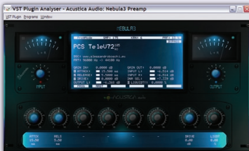
AlexB's Preamp Color Suite samples a host of desirable preamps, including this classic Telefunken V72 tube model.

Nebula is exceedingly good at capturing the sound of preamps, and this is a beautifully recorded collection offering a surprising amount of tonal variation between the various devices, from the hardness of 'AN81' to the warm bottom end of 'MTP std'. As expected, the tube models offer more character, and with the Telefunken V72 you even get both solid-state and tube versions. While you can tweak the sound with Nebula's Drive control, some preamps are also supplied in clean and driven versions for more real-world accuracy. I was surprised by the amount of extra 'snap' between the 'Focus8 CIn' and 'Drv' versions. I've ended up using PCS a lot just recently, and at just €20 it's a steal!