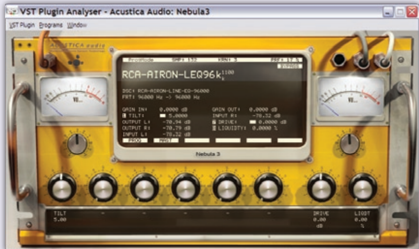
This unusual RCA-Airon EQ from Rhythm In Mind is a one-knob wonder, letting you add 'air' and remove 'mud' simultaneously!

and a few percent of mostly third-harmonic saturation down at the low end that proved ideal for adding flavour to drums and bass lines. However, the one that particularly appealed to me was the $10 vintage stereo RCA-Airon Line EQ for its unusual 10kHz program/tilt that reduces levels below this frequency and increases them above, allowing you to simultaneously add air and remove low-end mud, with the added bonus of an API transformer to add a little extra character.